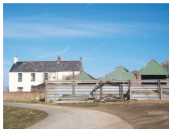
Hardstone Farm in the Tees Valley